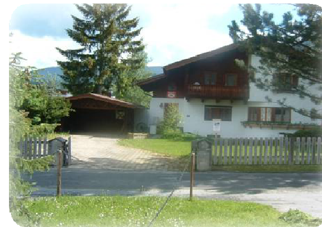
The Chalet in summer:

Playground - Barbecue area - Campfire - Old stock of trees